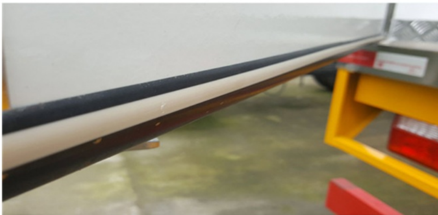
Stainless Steel Tail Box